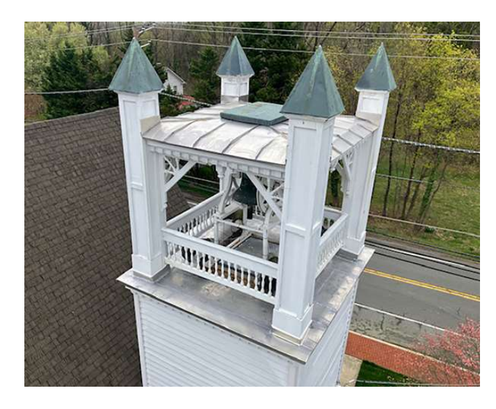
A bird's-eye-view of the completed tower with new roofing on upper and lower sections