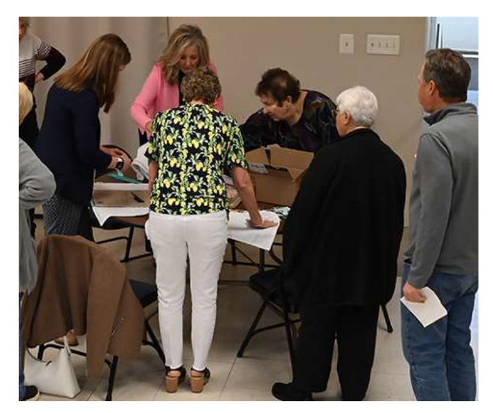
Learning how to package a kit

For our mini-mission, we assembled about 47 hygiene kits which were then shipped off for the next disaster relief effort.