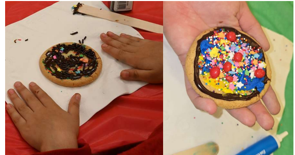
Cookies decorated by little hands

evening of music, photos, crafts, and cookie decorating.