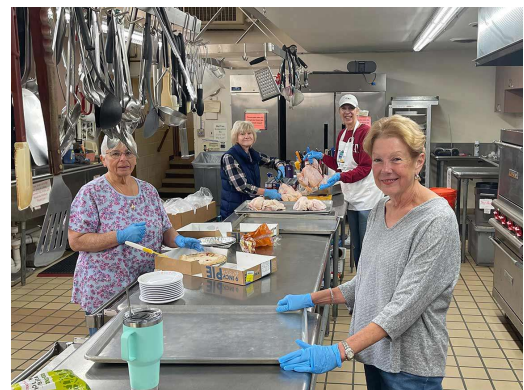
Four of the many volunteers in December

The next Salem volunteer day at The Lord's Table is Friday, January 3 . The location is Epworth United Methodist Church, 9008 Rosemont Drive, Gaithersburg, MD.