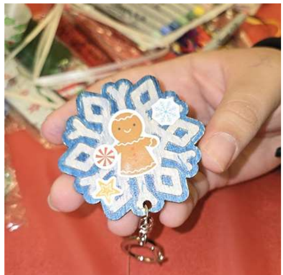
Child-assembled snowman keychain