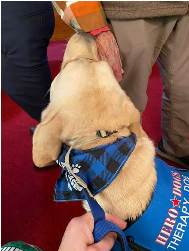
Sue sporting her Hero Dogs vest