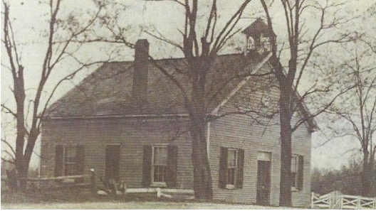
SALEM Methodist Protestant Church 1833

“187 Years and Still Loving, Serving and Celebrating”