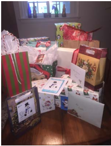
Above is a picture of the gifts; below pictured is Libby turning over the gifts to the Y.M.C.A representative'