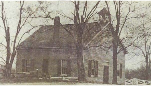
SALEM Methodist Protestant Church 1833

«187 Years and Still Loving, Serving and Celebrating»