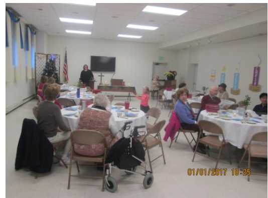
Salem's New Year's Love Feast