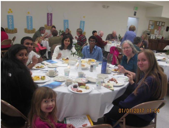
The attendance was great and the fellowship was overflowing with love for God and each other.

The call to Worship was in the form of a prayer well worth re-praying: