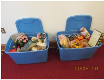
Two of our four baskets.

Our Christmas Baskets list filled up quickly and once again Salem stepped up to provide for those less fortunate this holiday season.