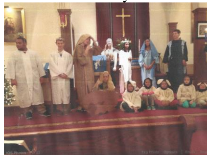
Cast members listed below

Our worship service for December 21st was presented by our youth group, which did a fantastic job.