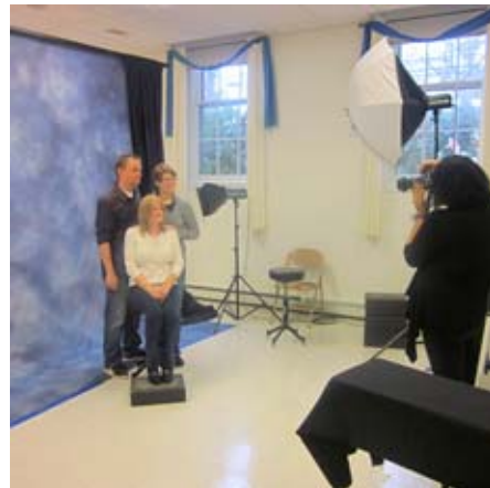
Photo session for the new Church directory went well. The directories will be out sometime after the new year.