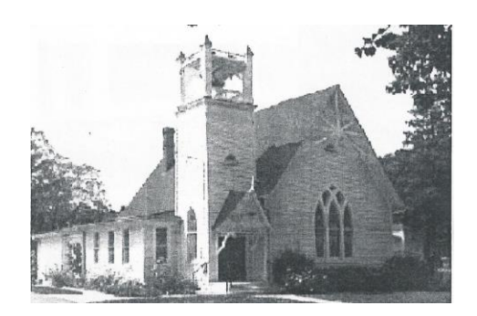
SALEM Methodist Protestant Church 1833