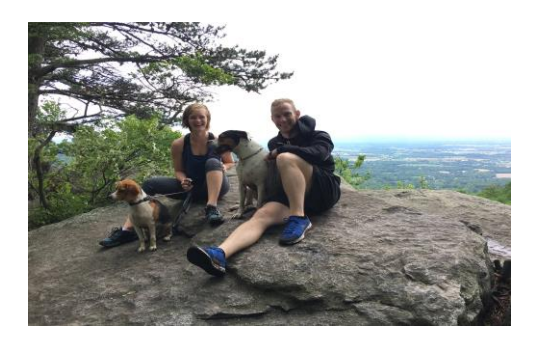
A WORD FROM OUR PASTOR