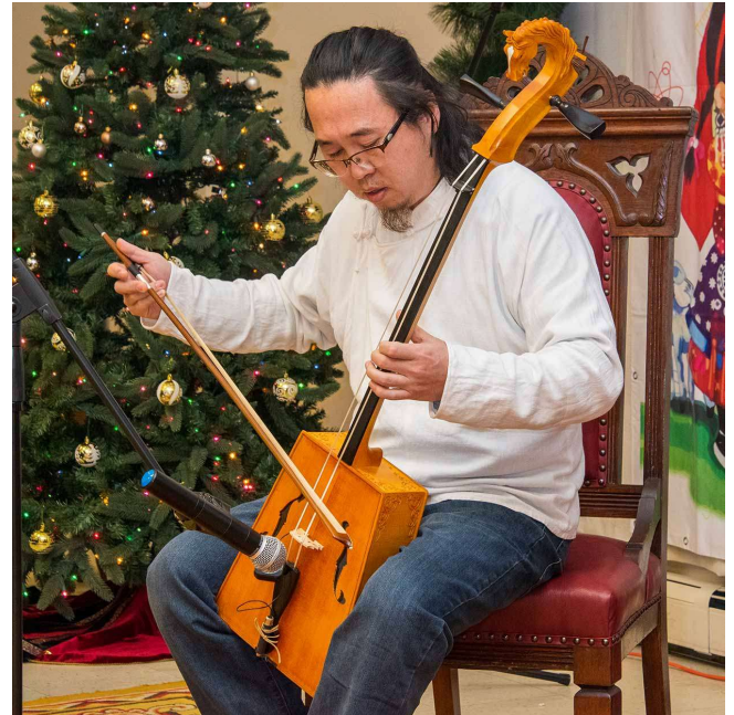
For additional photos on Facebook, see the “Mongol Erdem Language Culture School” where they have posted many pictures of the children.