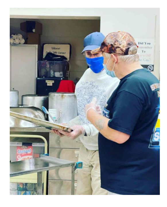
Olney HELP Food Donations

(Updated 05/11/22)—You may leave nonperishable food donations in the box in the Meeting Room behind the Sanctuary or in the marked box in the Community Hall. Suzanne Friis, Nancy Cox, and Joan and Mark Aebig will deliver them to Olney HELP. Most needed items: rice sides (Rice-a-Roni, Knorr), 1 lb bags rice, pancake mix/syrup, boxes of instant potatoes (boxes and pouches), canned corn (preferably low or no salt), baked beans (especially 28-oz cans), canned pasta (adult type) sloppy joe sauce, canned/pouches tuna, pasta sauce, small condensed soups (tomato, chicken noodle, vegetable), pasta sides (Knorr/Roni), canned chili, jelly, snacks for kids -granola bars, raisins, crackers, Goldfish, etc.