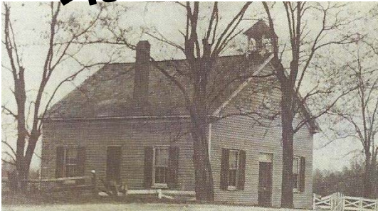
SALEM United Methodist Church 1833

“188 Years and Still Loving, Serving and Celebrating”