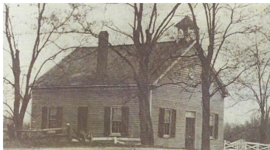
SALEM Methodist Protestant Church 1833

"187 Years and Still Loving, Serving and Celebrating"