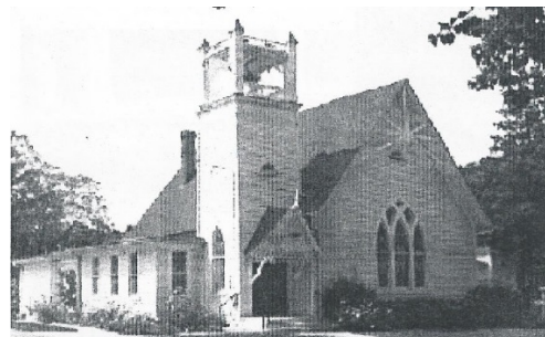
SALEM United Methodist Church 2021