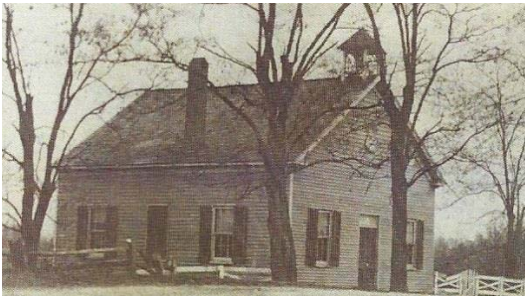
SALEM Methodist Protestant Church 1833

“187 Years and Still Loving, Serving and Celebrating”