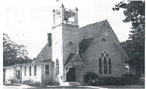
SALEM United Methodist Church 2019

12 High Street, Brookeville, Maryland 20833