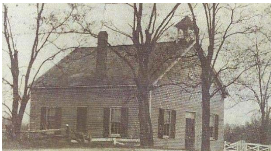
SALEM Methodist Protestant Church 1833

“187 Years and Still Loving, Serving and Celebrating”