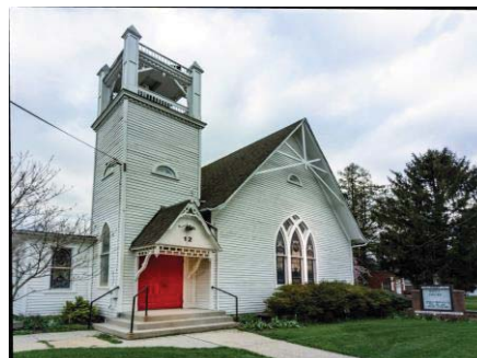
SALEM United Methodist Church 2020

12 High Street, Brookeville, Maryland 20833