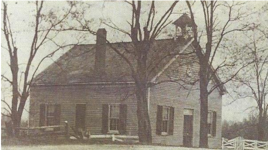
SALEM Protestant Methodist Church 1833

“186 Years and Still Loving, Serving and Celebrating”