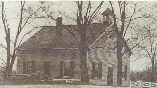
SALEM United Methodist Church 1833

«186 Years and Still Loving, Serving and Celebrating»