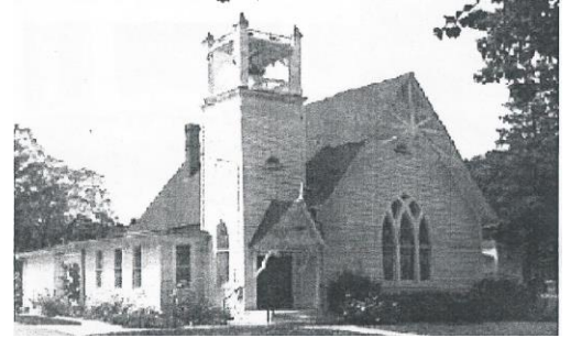
SALEM United Methodist Church 2019

12 High Street, Brookeville, Maryland 20833