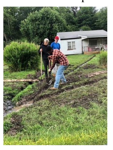
Salem ASP Day 5: Roof and drainage completed! Another home "warmer, safe, and DRIER!"