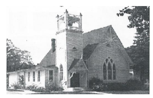
SALEM Methodist Protestant Church 1833