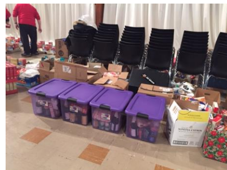
Purple containers and box are from Salem

Once again, as part of an ecumenical effort led by St Peter's Catholic Church, Salem contributed Thanksgiving food items for four boxes. They were full to overflowing. We also had a cardboard box filled with extra items. These baskets were distributed to families that are struggling financially and live in the Olney area.