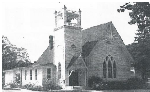
SALEM Methodist Protestant Church 1833

12 High Street, Brookeville, Maryland 20833