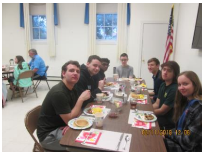
Work is done, now it's their turn!

Our thanks to the parents who helped prepare the feast, as well as, the young people and advisors who worked so hard to make this fund raiser a great success. We are pleased to announce $801.00 was raised toward their adventure.