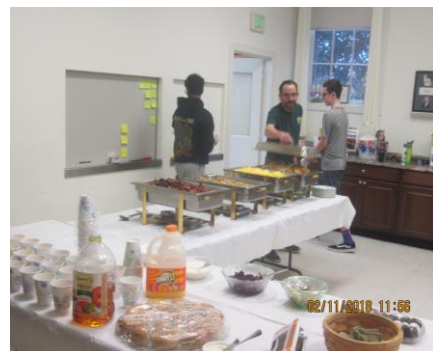
Last minute check

February 11 th found our ASP Team busy preparing breakfast for the Congregation's enjoyment and to raise funds for their trip.