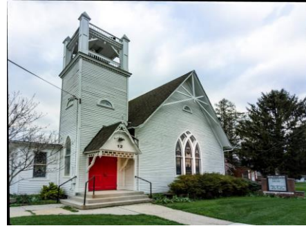
SALEM United Methodist Church 2018

12 High Street, Brookeville, Maryland 20833