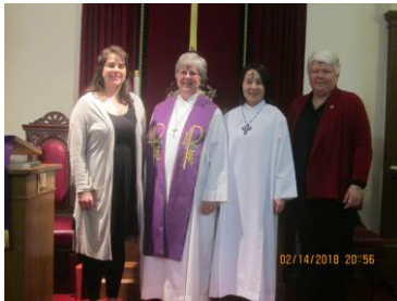
Our Worship Team