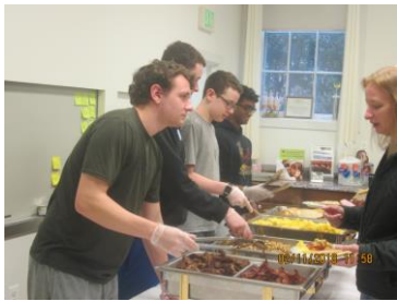
The line moved swiftly

Our thanks to the parents who helped prepare the feast, as well as, the young people and advisors who worked so hard to make this fund raiser a great success. We are pleased to announce $801.00 was raised toward their adventure.