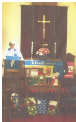
Snowman gifts being dedicated before being sent to the YMCA in 2015.

We will also help with the YMCA Youth Mentoring Program's annual holiday party. This program helps and strengthens some of the most vulnerable children in Montgomery County. As you may recall, we donate toys for a list of 20 children provided to us by the YMCA. Expect the "snowmen" that hold the children's names to be dropped off at our church very soon.