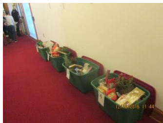
Previous year's baskets

Once again, as part of an ecumenical effort led by St Peter's Catholic Church, we will be creating four gift baskets for the Thanksgiving and Christmas holidays. These baskets will be distributed to families that are struggling financially and live in the Olney area.