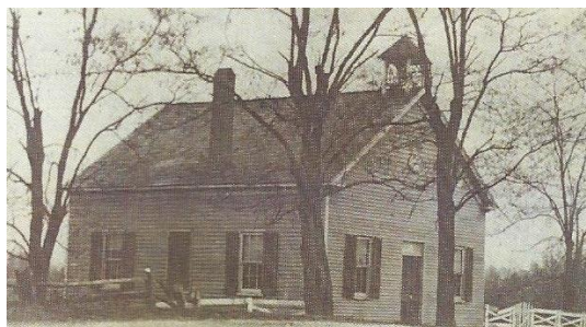
SALEM Methodist Protestant Church 1833

«184 Years and Still Loving, Serving and Celebrating»