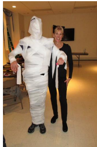
Adults had fun too!