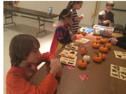
Hands-on art work