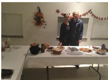
All parties need lots of food

The October 29 th youth meeting was their annual Halloween Party which was open to the community. Here is their story in pictures: