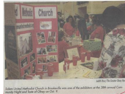
Taken from The Greater Olney News

Stories. In addition, we had the opportunity to connect with familiar faces as well as new ones.