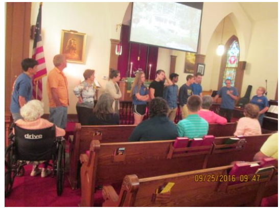
Our Faithful ASP Teams.

September 25 th our ASP team presented a special program so we would be able to see in pictures and word about their mission in the Appalachia Service Project 2016 in Logan County WV.