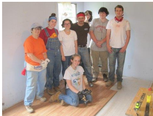
Appalachia Service Project 2016 -Logan County WV