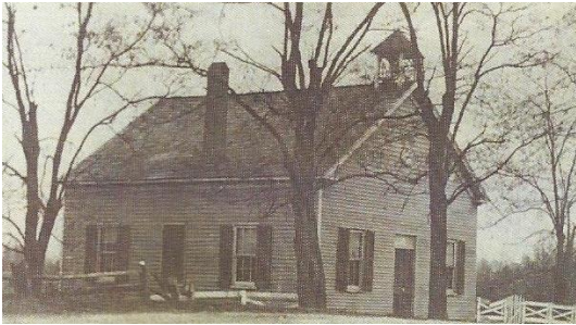
SALEM Methodist Protestant Church 1833

«183 Years and Still Loving, Serving and Celebrating»