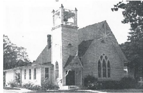
SALEM United Methodist Church 2016

12 High Street, Brookeville, Maryland 20833