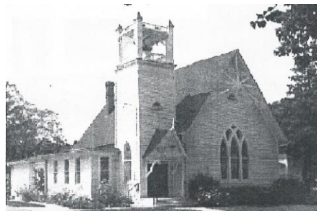
SALEM Methodist Protestant Church 1833

12 High Street, Brookeville, Maryland 20833