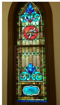
Window 5 is inscribed: “In Memory of Leebus and Ruth S. Griffith”

Eliza is also related, as daughter-in-law, to the dedicatees of window 5: