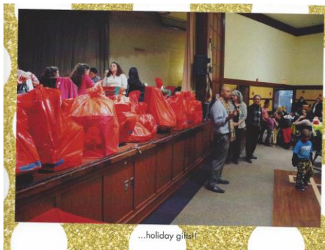
Along with other organizations and churches, we made a difference in a child's life.