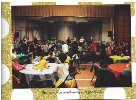
This picture gives you an idea of how large the party was.

YMCA's party was held on December 16 th and a booklet of pictures is posted on the bulletin board for your enjoyment, far too many to be shared in the newsletter; however here are a couple of them, along with their thank you note.