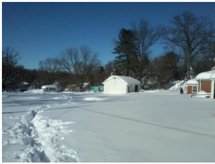
Mother Nature's gift

"I wonder If there's worship this morning at Salem..."