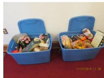
Two of our four baskets.