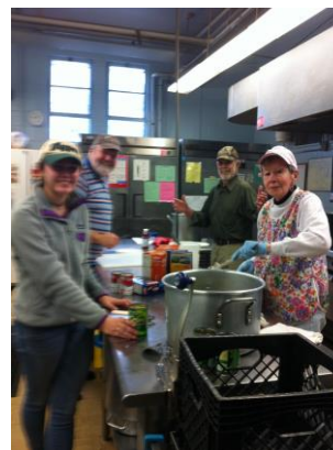
These are the faithful Salem servants preparing food at The Lord's Table....

December 27 th , The Lord's Table is a soup kitchen located at St. Martin of Tours, 201 S. Frederick Ave., Gaithersburg. We begin cooking at 1 pm and serve at 3:30 pm. We welcome everyone to come and help serve.