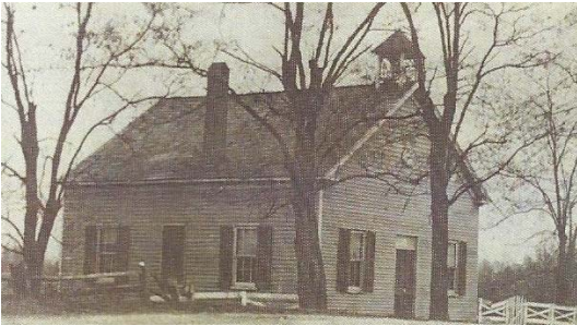
SALEM Methodist Protestant Church 1833

«180 Years and Still Loving, Serving and Celebrating»