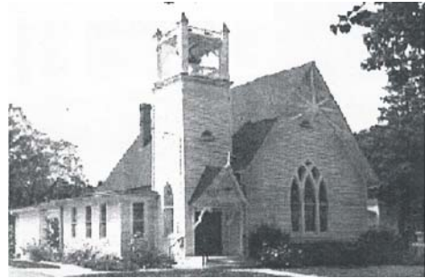
SALEM United Methodist Church 2013

12 High Street, Brookeville, Maryland 20833