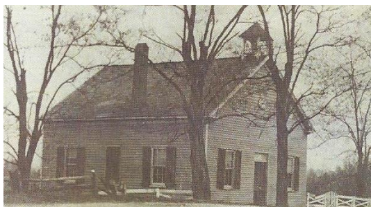
SALEM Methodist Protestant Church 1833

“180 Years and Still Loving, Serving and Celebrating”