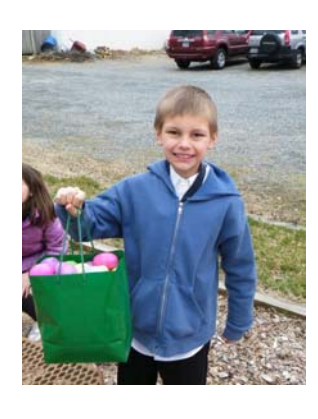
couldn't miss the eggs!

Eggs, eggs, everywhere, eggs! Are they hard to find? The turnout was very good, the children had a wonderful time and