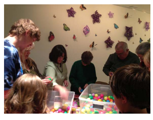
All hands busy at work.

We then played a card game that gave us insight into the Irish lore and our faith. When the games were over, we joined our efforts to prepare the plastic eggs for the Easter Egg Hunt.